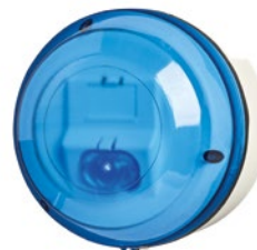
Visual Alarm Device (VAD)

ASYRA's I/O/Fault Module connects the system with other devices, such as door locking systems, ensuring alerts are triggered and communicate instantly when an alarm or fault is detected.