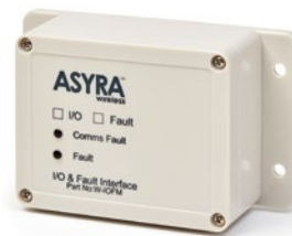
Interface and Fault Reporting Module