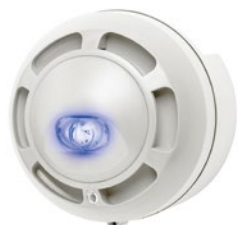
Combined Sounder & Visual Alarm

Clear audible and visual signals, designed to differ from fire alarms, help prevent confusion and ensure a fast, coordinated response during critical incidents.